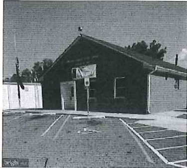
1 / 1